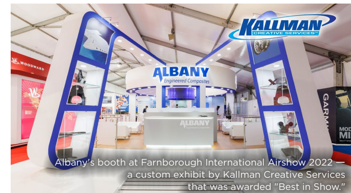
Albany's booth at Farnborough International Airshow 2022 — a custom exhibit by Kallman Creative Services that was awarded "Best in Show."

From the first concept to the last detail, our approach is simple: we're hands-on partners and honest collaborators who listen, design, and build to your specifications — on strategy, on time, on budget.