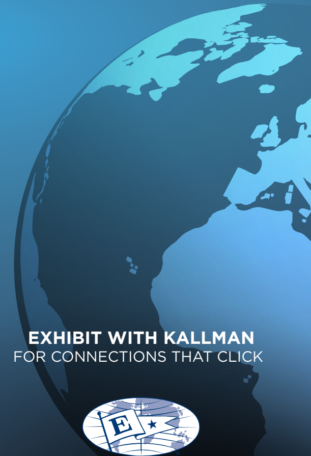
EXHIBIT WITH KALLMAN FOR CONNECTIONS THAT CLICK

PROUD RECIPIENT OF THE 2021 PRESIDENT'S 'E-STAR' AWARD FOR EXPORT SERVICE