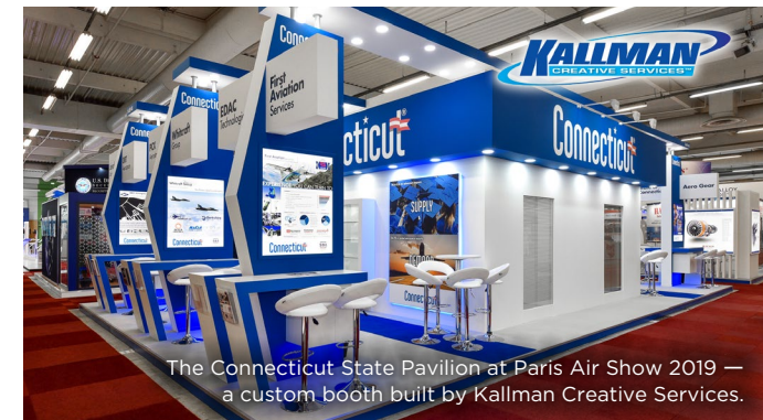
The Connecticut State Pavilion at Paris Air Show 2019 — a custom booth built by Kallman Creative Services.

PERUMIN | EXTEMIN September 2023 Arequipa, Peru