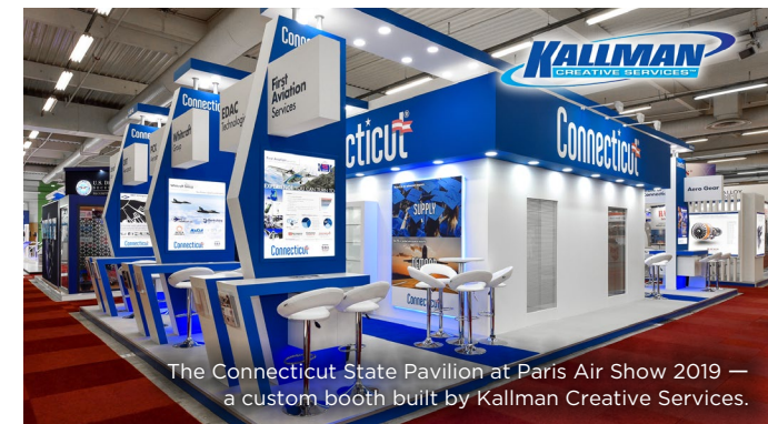
The Connecticut State Pavilion at Paris Air Show 2019 — a custom booth built by Kallman Creative Services.

PERUMIN | EXTEMIN September 2023 Arequipa, Peru