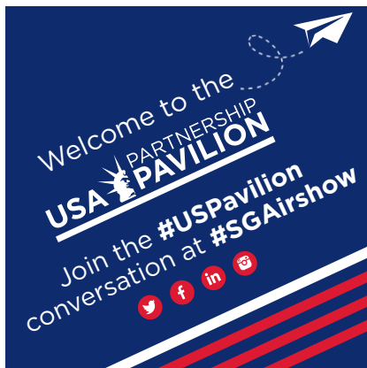
Acceptable Photo Artwork EPS or TIF File